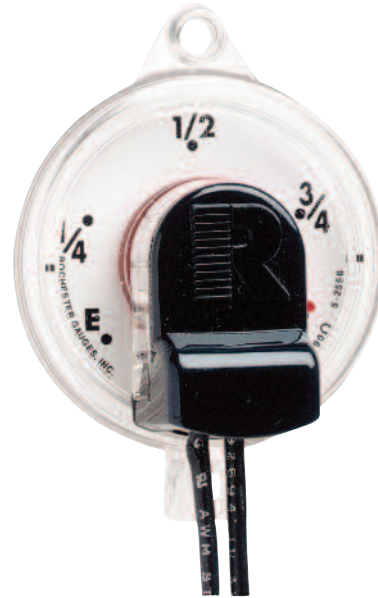
U.S. & Foreign Patents

The sender is mounted onto the Rochester Junior® gauge with #0040-00416 stainless steel dial screws (6 — 32 x 5/16"). An additional item available to ensure weatherproof connections from the TwinSite® to the receiver is heat shrink solder sleeves part number 0025-00495.